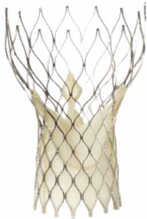
Figure 2 The Medtronic CoreValve. A self-expanding nitinol frame to which is sewn porcine pericardial leaflet in a trifoliate configuration

Transcatheter aortic valve implantation is indicated for selected patients at high or prohibitive surgical risk. Thus, the advent of TAVI has renewed interest in the use of surgical risk algorithms. Surgical risk has been quantified using the logistic European System for Cardiac Operative Risk Evaluation (EuroSCORE) (7) and the Society of Thoracic Surgeons (STS) Predicted Risk of Mortality score (8). However, these scores share important limitations in high-risk patient subsets, most notably a limited