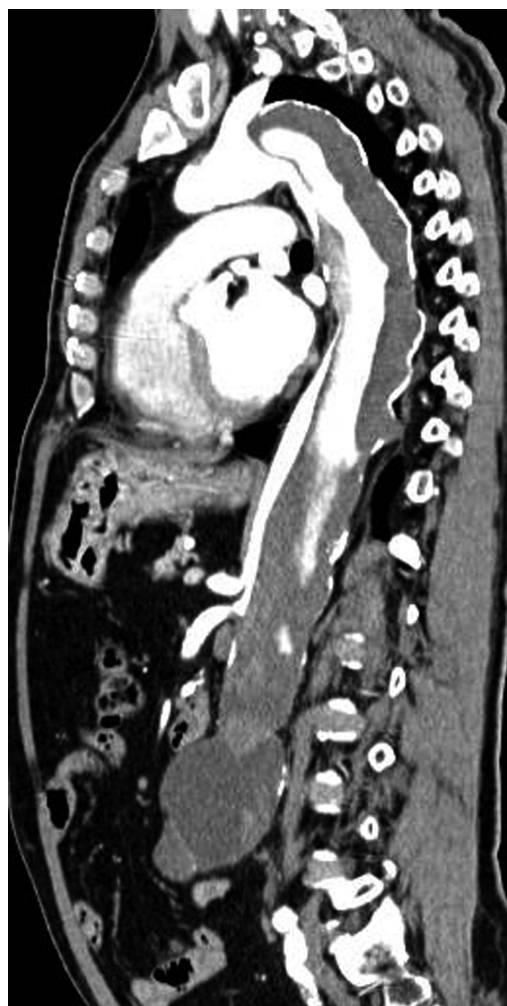
Figure 2 Angio CT image showing the residual DeBakey type 1 aortic dissection of the thoraco-abdominal aorta

The sheath was pulled back and removed while the delivery system was anchored at the handle. The splitter was removed from the device, and the release clip and wire were pulled to fully release the device from the delivery system. Once the stent-graft was deployed, the distal anastomosis was performed with a 3-0 polypropylene