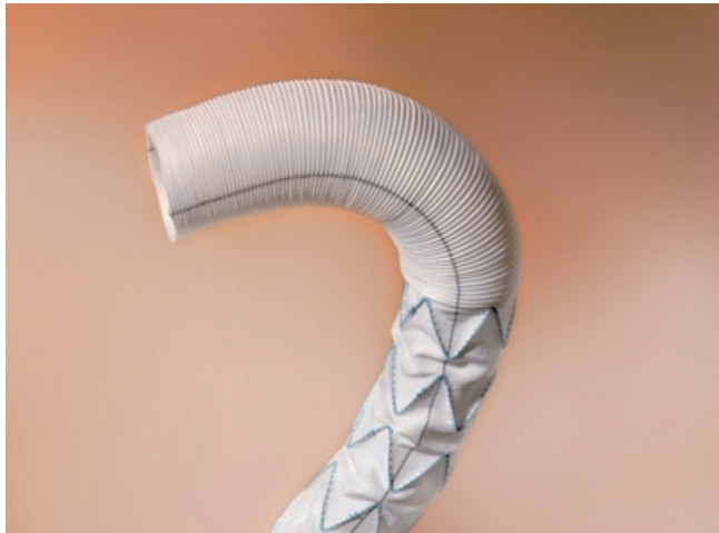
Figure 1 The E-vita open plus prosthesis (Jotec Inc., Hechingen, Germany) composed of a distal nitinol-covered stent-graft sutured to a proximal conventional graft

Since 1996, ASCP has represented our method of