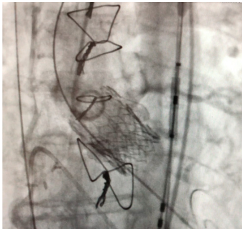
Figure 4 A 20 mm Sapien 3 valve is placed into a failed Perceval size S valve.

The V-i-V procedure was performed using a 20 mm Sapien 3 transcatheter valve.