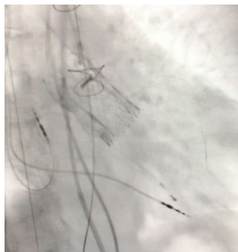
Figure 2 A 29 mm Evolut R is placed into a failed Perceval size L valve.