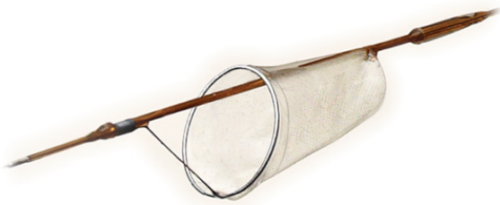
Figure 3 FilterWire EZ™ Embolic Protection System (Boston Scientific Corporation, Marlborough, Massachusetts, USA).