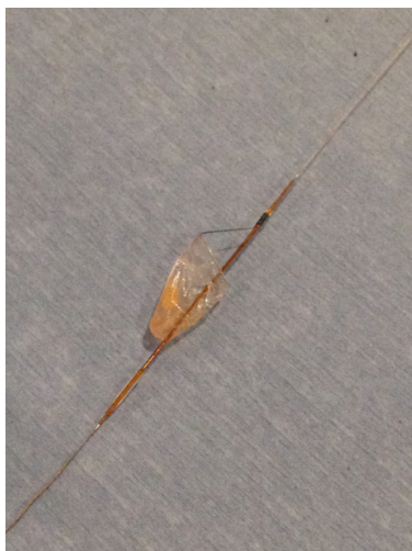
Figure 4 FilterWire EZ™ Embolic Protection System (Boston Scientific Corporation, Marlborough, Massachusetts, USA) containing embolic debris captured during an branched aortic arch endovascular repair.